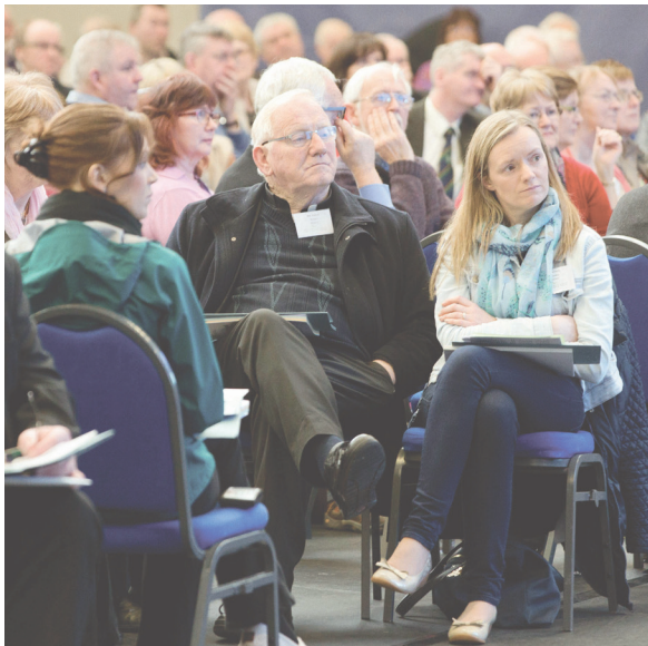
Delegates from April's Synod voted in favour of reconnecting with the youth and the Pastoral Plan has set about core actions to follow to achieve this.

Creating a Church that ensures young people feel more connected at local as well as diocesan level is a key priority under the Limerick Diocesan Pastoral Plan - 'Moving Forward Together in Hope' – from this year's Synod. The diocese has spent the months since last April's gathering analysing the data that emerged at the Synod and has come up with a plan of action to ensure it serves the needs of the people Limerick going forward. One of the key Synod findings was the need for the Church to do more than lament young people's disconnect with it – instead it must engage in purposeful action to address this. The plan launched this week sets out a hope that, by implementing its agreed actions, young people feel connected, involved and active in a mul-