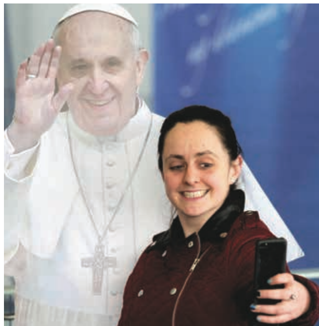
A cardboard cut out of Pope Francis proved popular

58.1% support proposal 11.2% reject proposal